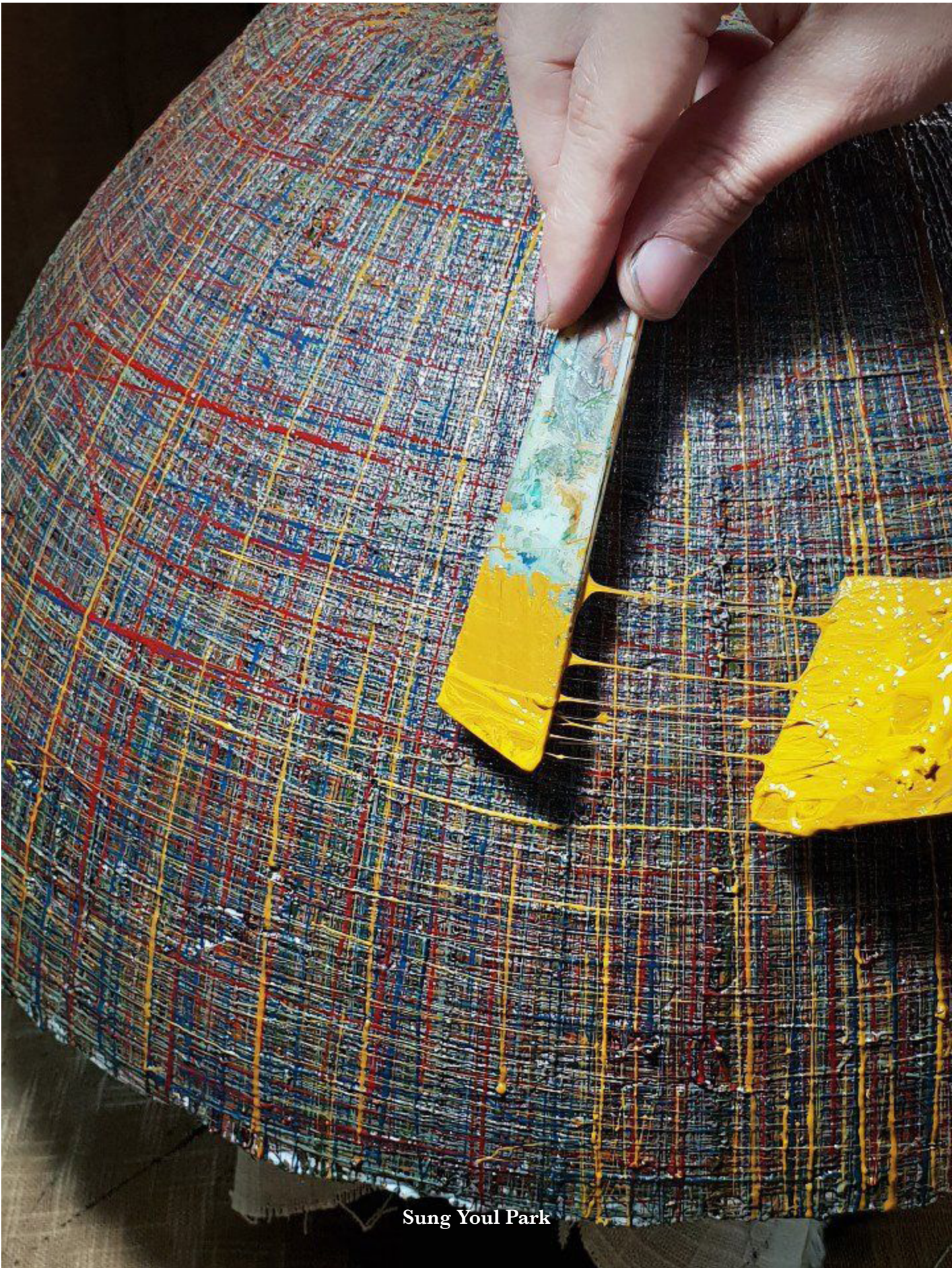
Sung Youl Park